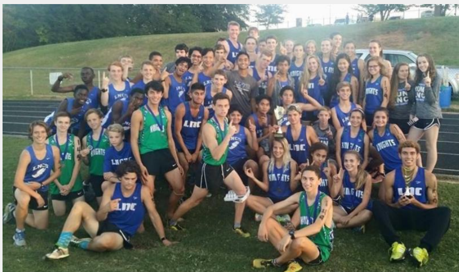
HS Cross Country team

If you have photos of our MS & HS athletes in action, please email them to slay@Incharter.org and mjoseph@Incharter.org for placement on our social media, website and Knights News.